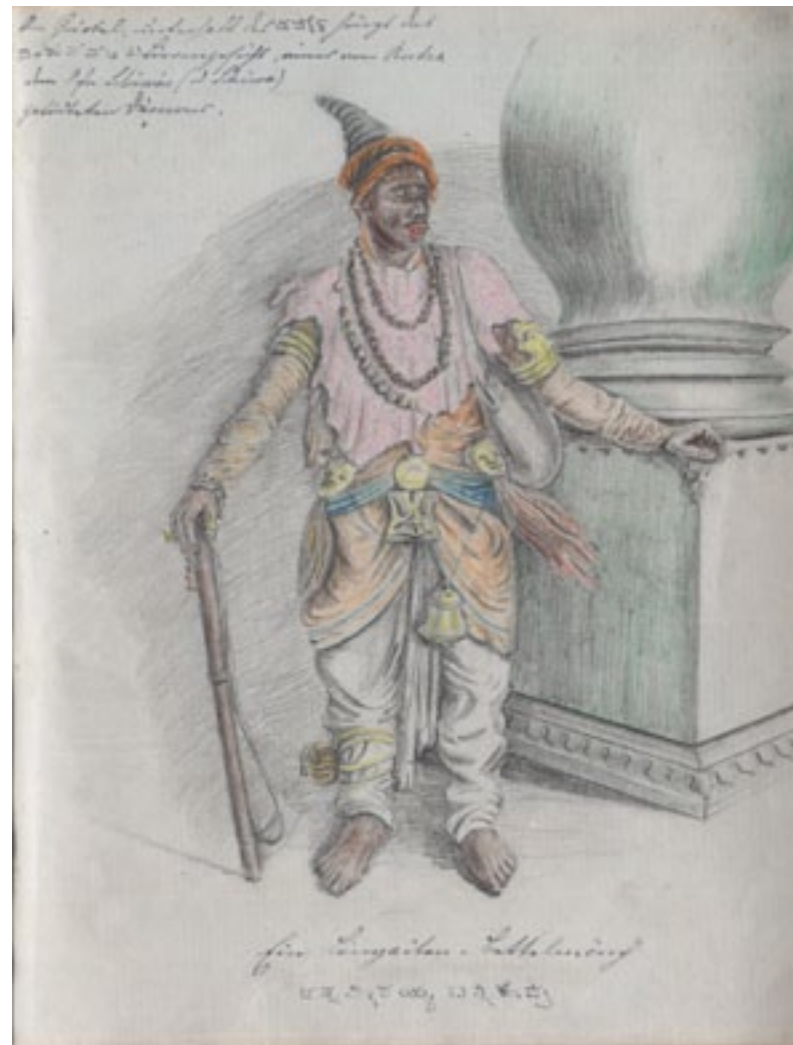
Ein Lingaiten = Bettelmönch